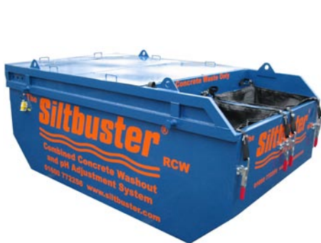
Combined pH Adjustment and Solids Removal