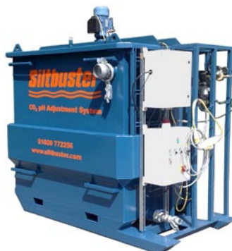
pH Adjustment Skid (DS4)